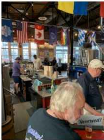
Garrison's Brewery Captains meeting