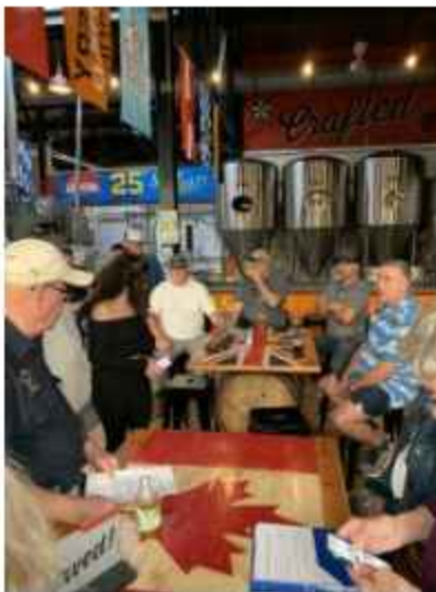
More Captains and Crew at Garrison's