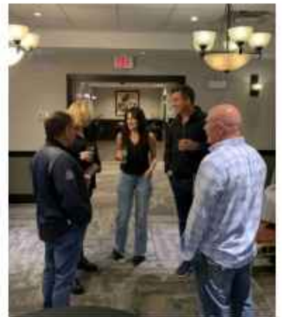
Team Chasing Tail socialising prior to the ceremonies.