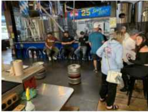
Captain's and Crew