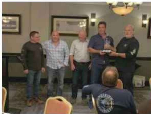
First Place – Team Chasing Tail