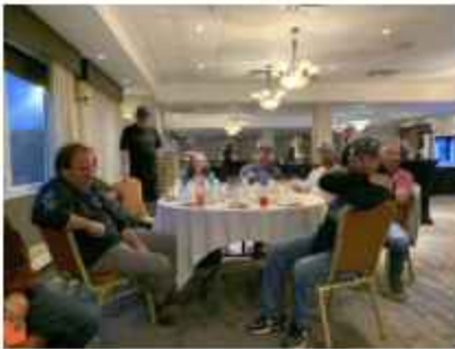
Teams Rubber Boots Bandits and Team Viking before the ceremonies

Representative from 4 teams were present for this years closing as again most of the Cape Breton crews had sailed back to Cape Breton and were not able to attend the closing ceremonies. Even so there was a nice period of socialising before the commencement of the event with around 25 team personnel present.