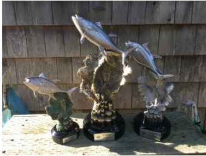
Late arriving trophies

Closing ceremony gathering was held on Sunday Sept 24th from 7 to 9 p.m. at the Best Western Plus, Chocolate Lake Hotel, 250 Saint Margaret's Bay Road.