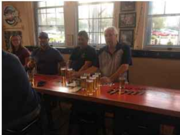
Good times 2023