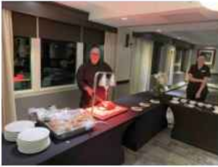
Prime Rib Carvery