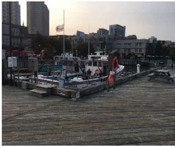
Some of the Cape Breton contingent vessels that will be docking on the Halifax waterfront during the tournament.