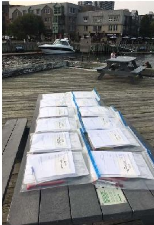
The Registration packages