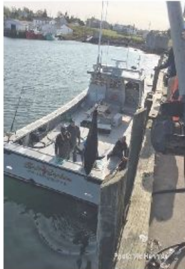
Team Shorty-LRU unloading at Oceanview

Mid afternoon both teams Blindstrike and Shorty-LRU hooked up and eventually secured tuna. Team Shorty-LRU on the Lilah Sophie delivered a 349 lb tuna at 16:00 and Team BlindStrike delivered a 581 lb tuna at 18:00 to the Sambro weigh in.