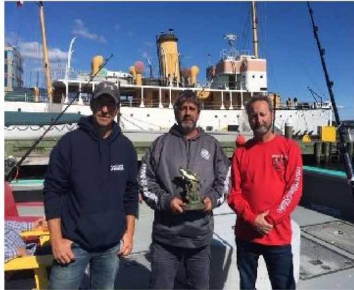
Team Blindstrike with 3rd Place Trophy