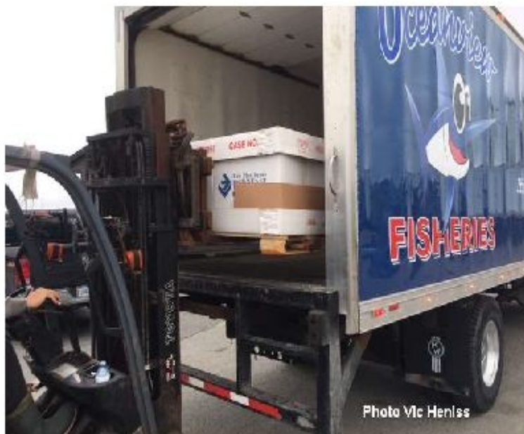
Some of the tuna being loaded for the airport at Oceanview on the 18th.

Around 14:30 Team Jacobite delivered a 190 lb tuna to Sambro leaving one tag to be filled and with team Chasing Tail hooked up and fighting a fish. Around 15:30 team Chasing Tail reported that they had secured their fish making it the 10th fish of the tournament and officially the tournament is over for 2020 . At approximately 16:30 team Chasing Tail delivered a nice 598 lb tuna to the dock at Oceanview Fisheries in Sambro.