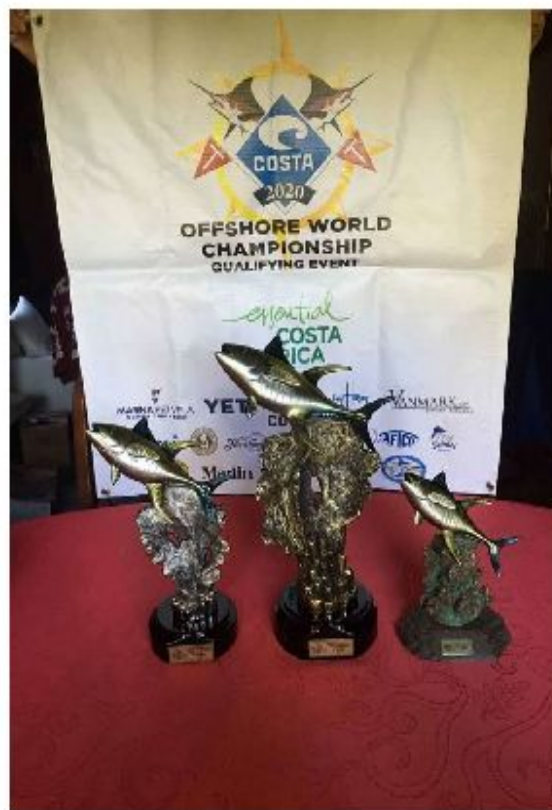
The 2020 Trophies

The closing ceremonies social gathering will not be held this year. Final results will be posted on this website and winning teams will be notified. Trophies will be sent to the winning teams after the tournament.