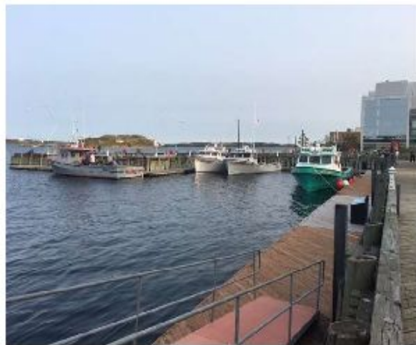
The Cape Breton Participant boats.